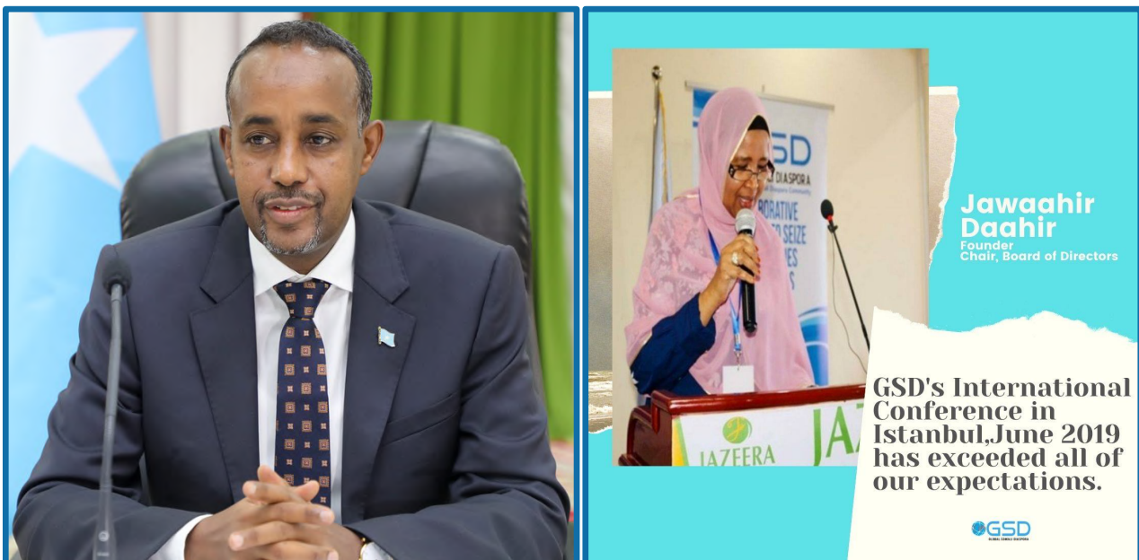
Image 1: H.E. Somali Prime Minister, Mohamed Hussein Roble

The Prime Minister spoke about the significant contributions made by the Somali diaspora in the continual development of the country, while urging the diaspora, especially the youth, to become more actively involved in Somalia's progress.